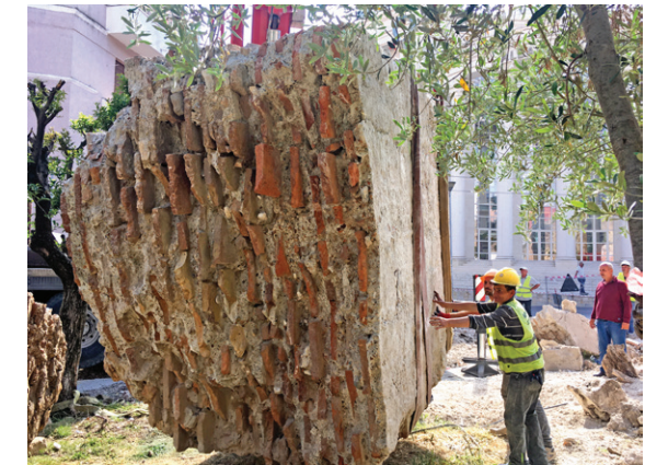
The "C" Tower is being restored by CHwB Albania within the project "Conservation and Reinforcement Interventions in the "C" Tower, of Durrës Castle", with the support of US Embassy Albania Ambassadors Fund for Cultural Preservation, through CHwB Albania.